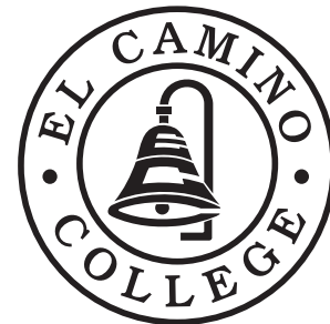
ECC Logo in Black