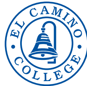
ECC Logo in Reflex Blue

Do not copy the logo off Web pages or scan it off printed material.