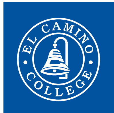
ECC Logo in Reverse on Reflex Blue